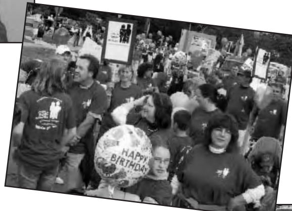
A. Rowdy CFS fans (well, some are rowdier than others!) cheer on their favorite team at the Child and Family Services Appreciation Night with the Traverse City Beach Bums last month.