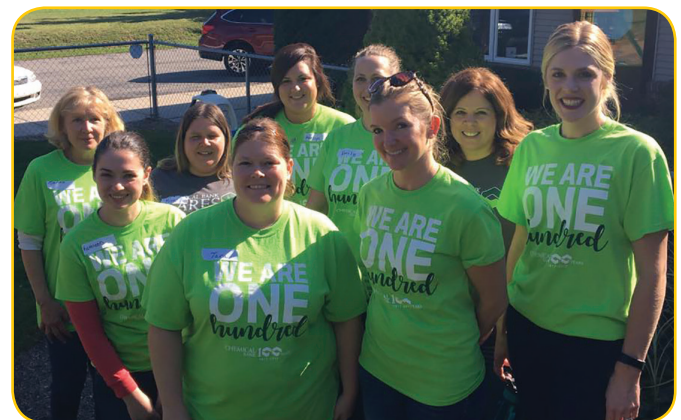
Once again, Chemical Bank employees cleaned up our building and grounds during Chemical Cares Day.