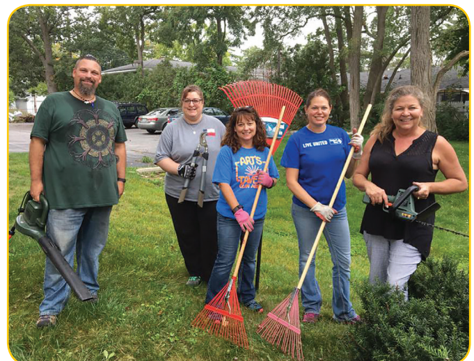
Real Estate One employees volunteering on United Way Day of Caring.

Thank you to our friends at Lowe's for donating and installing a new playground at our Traverse City office. Our neighbors, Traverse Catholic Federal Credit Union, saw all of the commotion and brought our volunteers lunch – how cool! The kids love their new playground. Thank you neighbors!