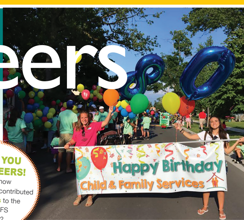
CFS and friends had a "Marching Birthday Party" in the Cherry Festival's Junior Royale Parade to celebrate our 80th Birthday!

Did you know 500 volunteers contributed 7,053 hours to the work of CFS last year?