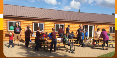
Harbor Springs Foster Parent Appreciation Picnic

This year we had 650 Volunteers and more than 7000 hours.