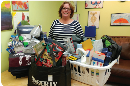
Donated graduation gifts to our youth!