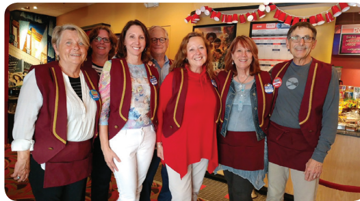
State Theatre volunteers