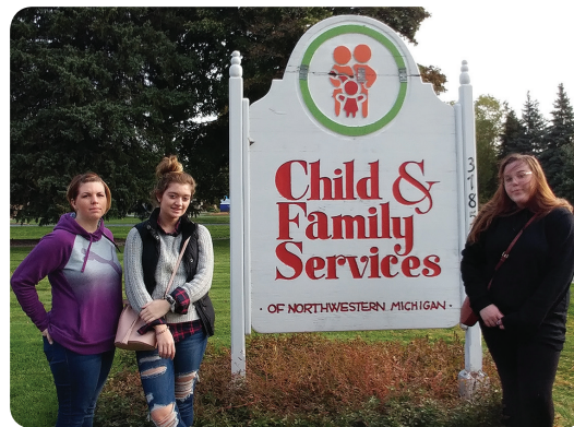
Thanks to Old Navy employees for their help around CFS!