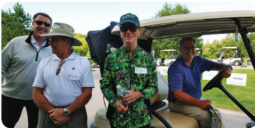
Kingsley Club Volunteers at Tee Up Fore Kids Golf Outing